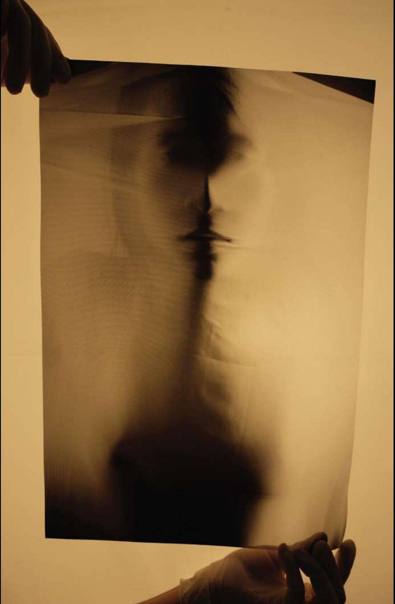
Final Result ▶